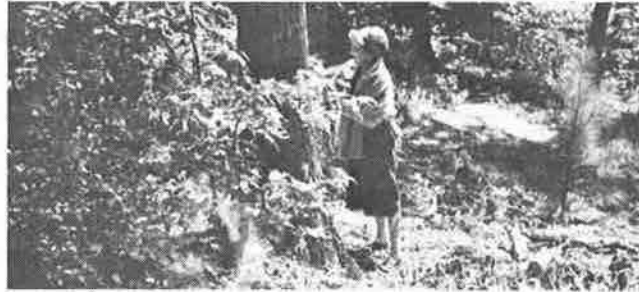
Above: Her dress full of apples, she visits the animals around the farm on a daily ritual, collects a flower or two (right), and gets the mail.